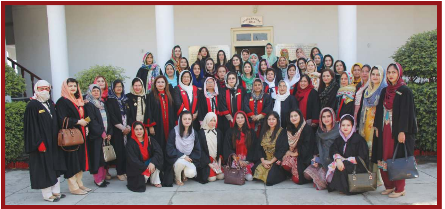
Honorable Staff of the College